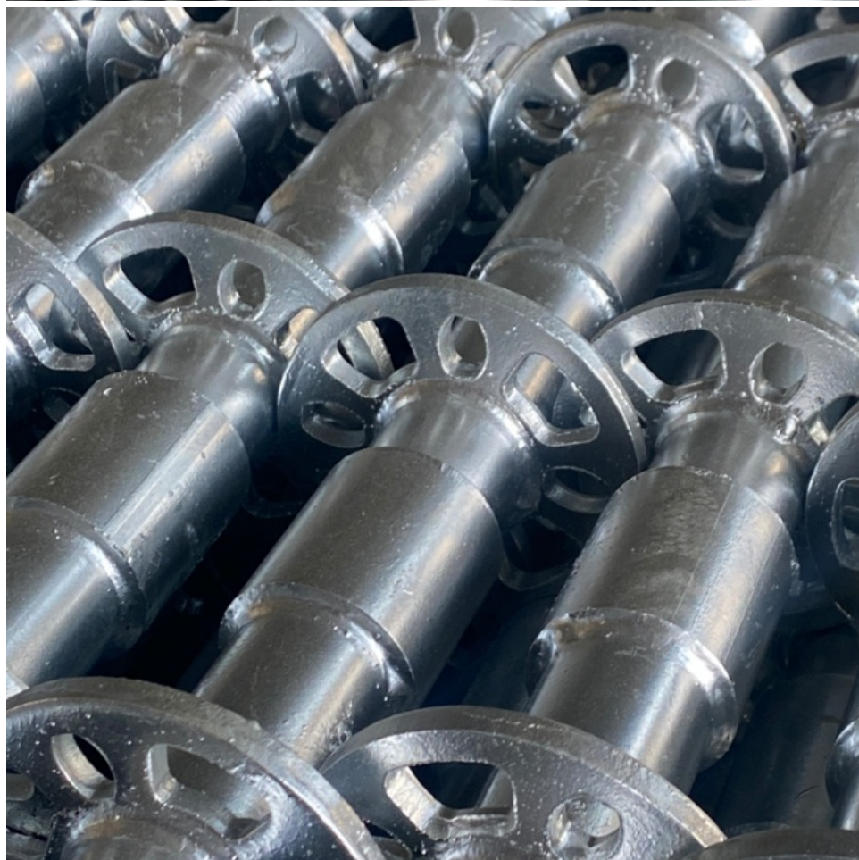
Warehouse & Loading